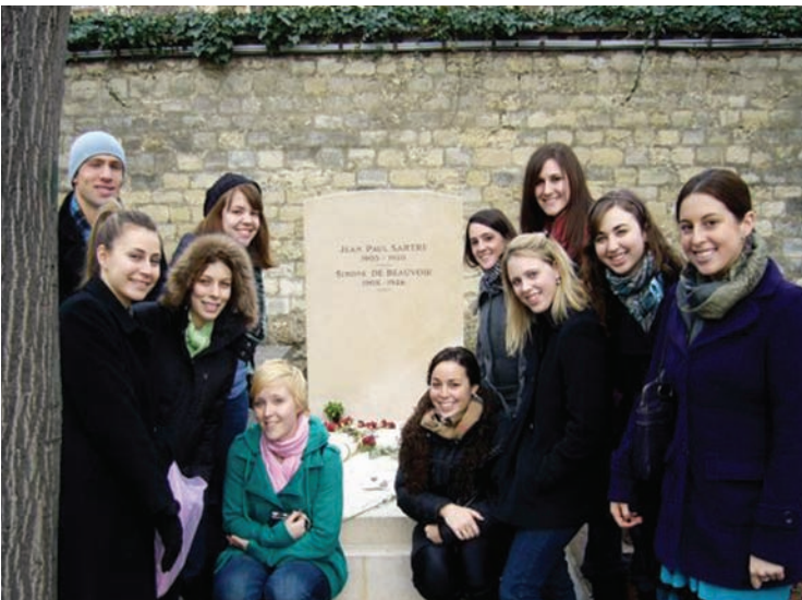
Feminism in France Study Abroad Students in Paris at the Grave of Simone de Beauvoir and Jean-Paul Sartre