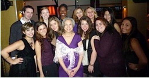
2012 Women's Studies in Paris, France