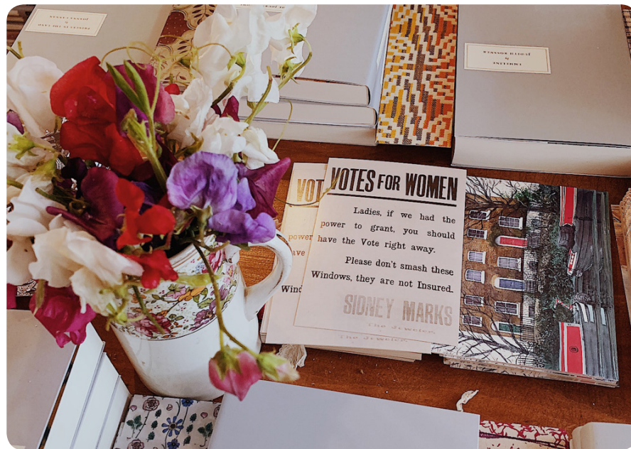
taken August 2019 at Persephone Books, London, which sells novels by forgotten female authors

As with Murakami's previous works, the boundary between the real and the magical is so expertly woven that the reader is left wondering which world the protagonist is occupying. As readers enter yet another of Murakami's alternative worlds, we follow the mysterious journey of a portrait painter processing the failure of his marriage and determining the future of his career. In the home of a famous Japanese artist, he discovers a painting that serves as a portal to a parallel world in which the struggles of the subjects in the painting, and the individuals drawn into it, provide harrowing adventures that help make sense of life's disappointments, reconfigure the experience of loneliness, and reevaluate the necessity of romantic love.