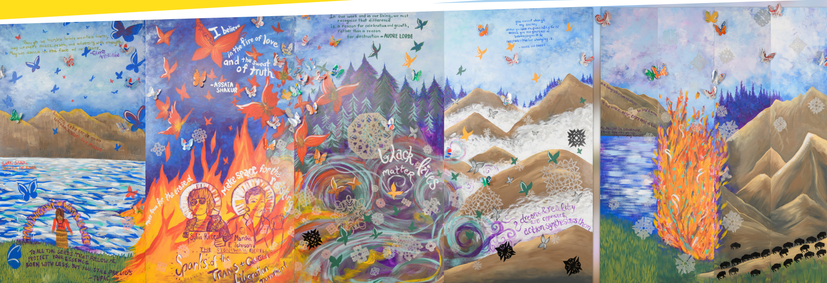
"Freedom Making" Mural in James Smith Hall, University of Delaware; created by members of the LGBTQ+ and Racial Activism Living Learning Community, the Visual Arts Living Learning Community, and UD students from all-gender University of Delaware housing.